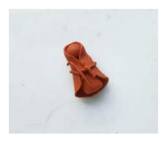
Step - 7:

Cut off extra parts of the rope if required and use the extra clay to form the cane. Attach the cane on a side of the clay Joseph figure.