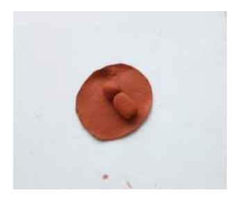
Step - 12:

Place the clay head and the body on the flat clay piece.