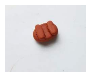
Step - 10:

Shape the clay piece into an oval shape and then use your fingertip to indent the middle.