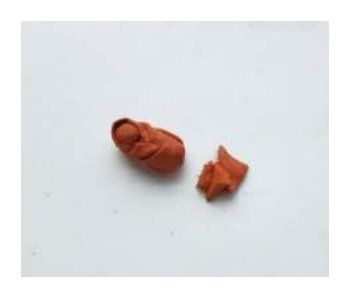
Step - 13:

Wrap the baby Jesus clay figure with the flat clay piece as nicely as you can. Cut off the extra part of the flat clay piece after wrapping the baby Jesus.