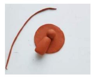
Step - 4:

Place the clay ball (the head) on the flat disc near the top. Place the body shape on the disc right below the head.