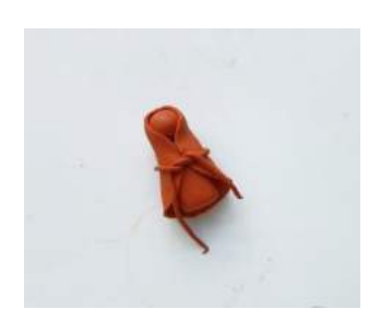
Step - 6:

Carefully wrap the clay rope around the waist of the clay figure and tie it in the middle.