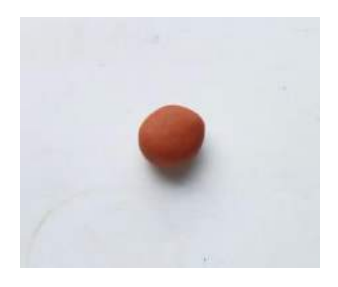
Step - 8:

Cut off a slice of clay to craft the manger pattern.