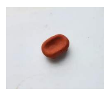
Step - 9:

Shape the clay piece into an oval shape and then use your fingertip to indent the middle.